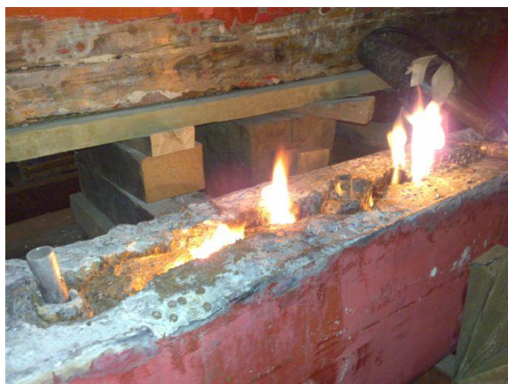
Pouring New Lead into Hollow Ballast Keel

The keel bolts, which could well be original, were all in good shape. It was, however, a surprise to find a large hollow in the centre of the lead running almost the length of the keel presumably due to air bubbles when it was first cast. To rectify this defect a considerable quantity of replacement lead were added to bring the top surface flush.