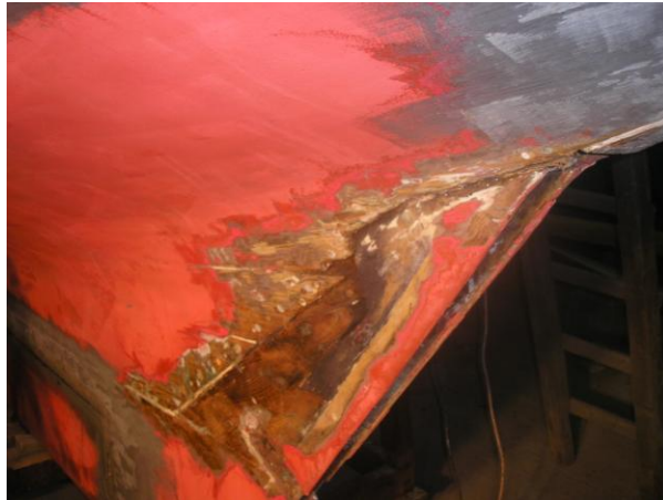
Exposed Rotten Horn Timber and Deadwood From Below

In March serious rot was found in the horn timber near the point where the rudder post passes through it and an area of the hull under the stern was distorted.