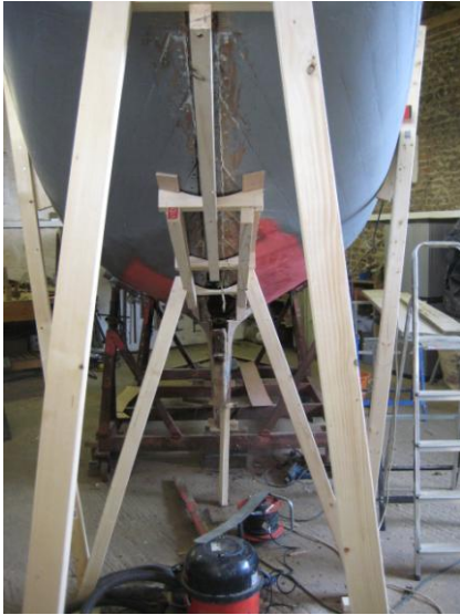
Framework Supporting Stern

rejoined to the horn by scarfing in new lengths. It was found necessary to replace rotting wood in the deadwood aft of the keel by fabricating a new one. Finally fitting a new deck aft and covering boards completed this part of the work.