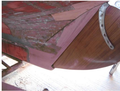
New planking deadwood and Rudder